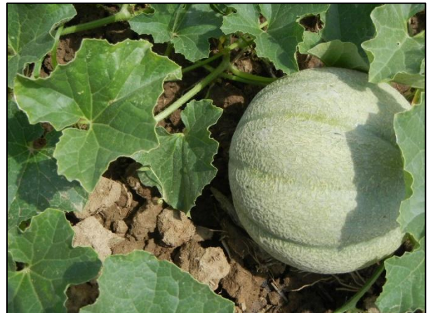
Below: Cantaloupe sizing up nicely.